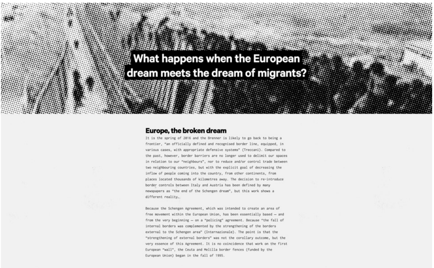
Figure 1. Homepage of the visual journalism project, 2016.

Europa Dreaming has awarded with European Design Award 2017 (Bronze, digital infographics)