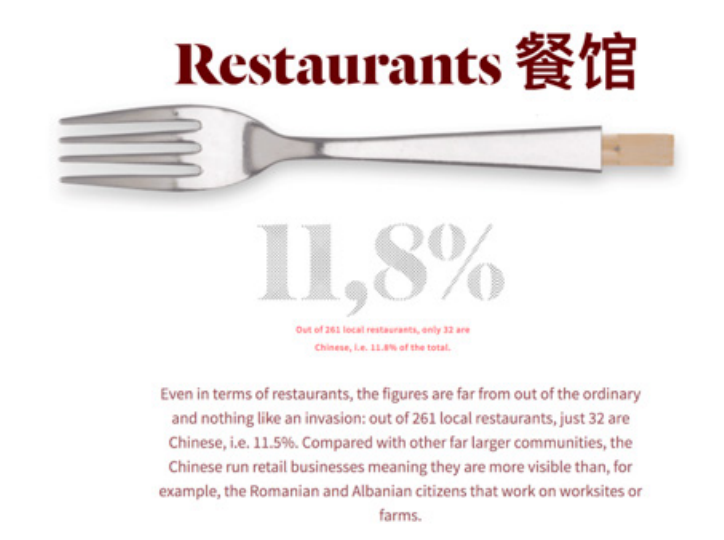
Figure 3. Data visualizations that debunks the stereotype about Chinese restaurants "invasion" in Bolzano, 2014.