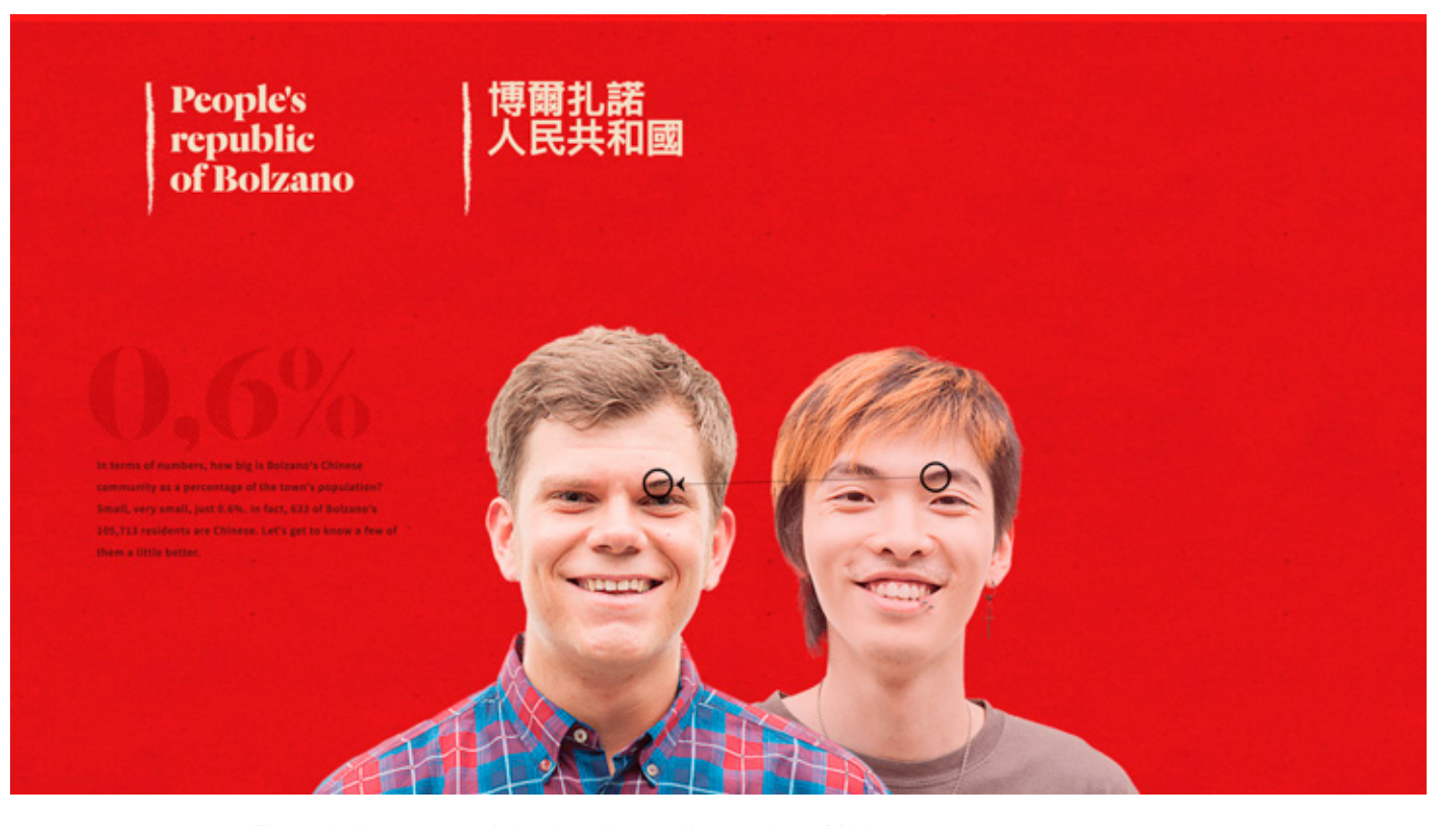
Figure 1. Homepage of the visual journalism project, 2014.

Through a design project based on more transparent and balanced information, thereby allowing a broader audience to inform itself on such a complex and multifaceted issue, the project opened a local debate about the integration of the Chinese people in the city, that led the local media purveyor of the "invasion" theory to reverse its narrative.