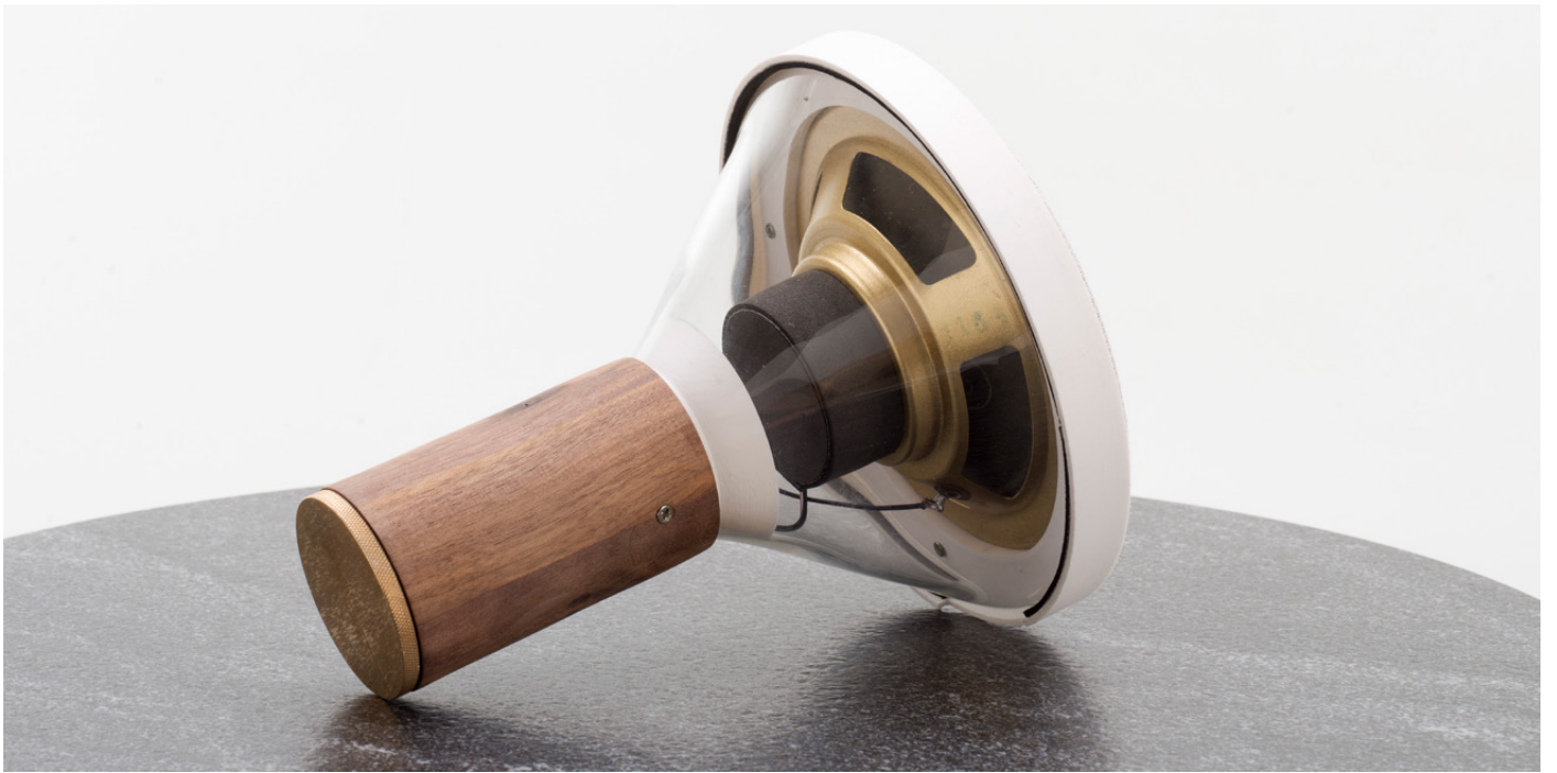
Figure 4, 5