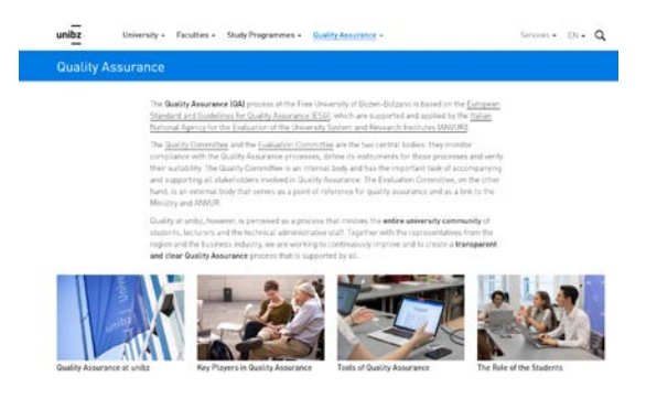
Webpage for Quality Assurance containing all relevant public information